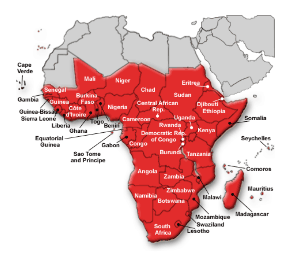
Figure 1 . Countries the make up the sub-Saharan region in Africa.

Women in sub-Saharan countries are considered to be one of the most vulnerable populations in the world for HIV (see figure 1 for a map of sub-Saharan Africa). Three quarters (76%, or 13.2 million) of all the HIV positive women in the world live in sub-Saharan Africa (UNAIDS, 2006a). Women in sub-Saharan Africa also make up 59% of the adults living with HIV, and almost three quarters (74%) of young people aged 15 – 24 years living with HIV are female (UNAIDS, 2006a). While women in many parts of the world have a longer life expectancy than men, in four countries of sub-Saharan Africa – Kenya, Malawi, Zambia and Zimbabwe – the life expectancy of women has been driven to lower than that of men as a result of AIDS (UNAIDS, 2006a). A wide range of biological, economic, and socio-cultural factors make African women vulnerable to HIV infection. African women and girls typically have less access to education and health information, suffer inequality in marriage and sexual relations, are economically dependent on their male partners, and are part of cultural traditions that reinforce gender inequalities (Aniekwu, 2002; UNAIDS, 2006b). Additionally, women in general are physiologically more vulnerable to HIV infection than men.