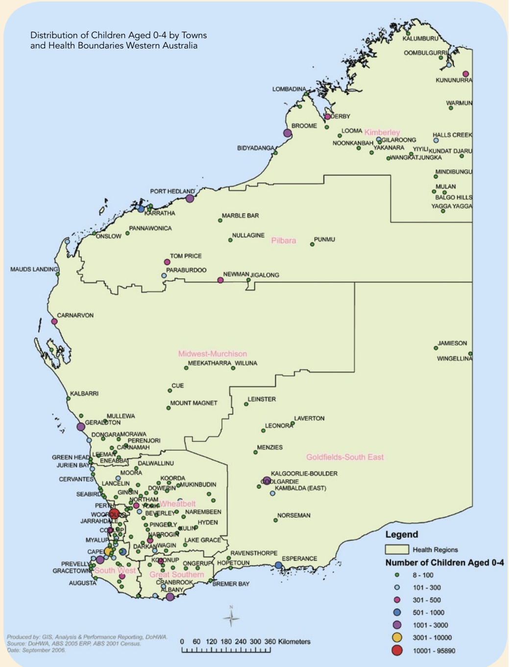
Distribution of Children Aged 0-4 by Towns and Health Boundaries Western Australia

Overall, the population data suggests that on a range of indicators, children and youth in the WHR appear to mirror their counterparts across the State as a whole.